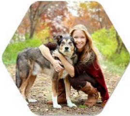
#4860 Hexagon Shape with 1" magnet

Semi-Gloss Aluminum Magnets now available in these five shapes!