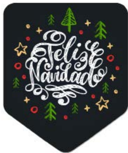
#4862 Banner Shape with 1" magnet