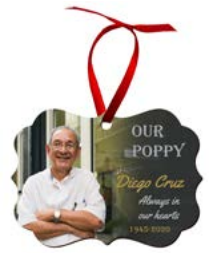
#4870 Benelux Shape Ornament with Red Ribbon can be used with #4873 Aluminum Jig, 6-Up