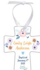
#4855 Cross Shape Ornament with White Ribbon