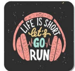
#4864 Square with 1" magnet