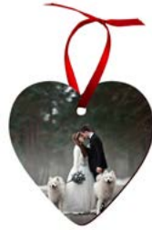
#4868 Heart Shape Ornament with Red Ribbon can be used with #4871 Aluminum Jig, 6-Up