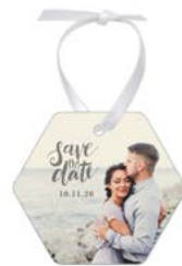
#4854 Honeycomb Shape Ornament with White Ribbon

These two-sided white gloss aluminum ornaments are durable, lightweight and will last for years to come!