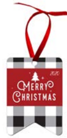
#4869 Bunting Shape Ornament with Red Ribbon can be used with #4872 Aluminum Jig, 8-Up